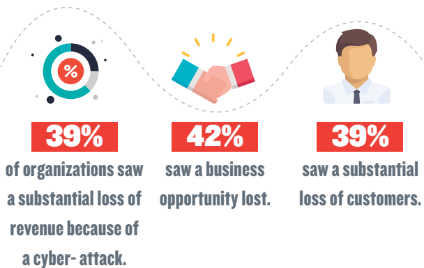
Source: Cisco 2017 Annual Cyber Security Report

An outage can shut down your business and lead to loss of productivity and income. Ensure outages are not an issue with the Cybersecurity Assessment.